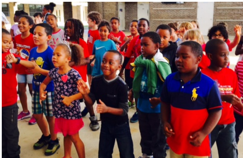
Christa McAuliffe Elementary